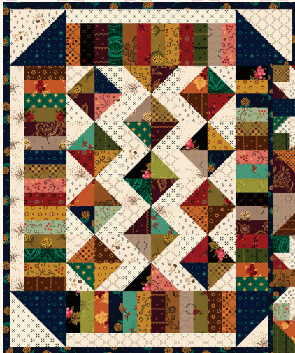
▼ Starshine 25½" x 25½"