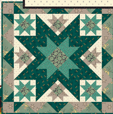
▶ Midnight 20½" x 20½"

Available for order by shops July 2020. Delivery of fabric December 2020.