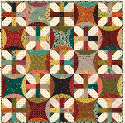
▶ Heartstrings 25½" x 25½"