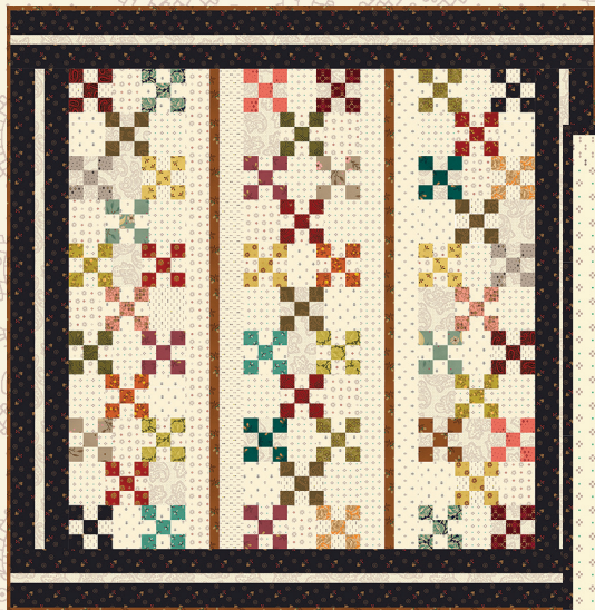
▲ Party of Nine 30½" x 31¼"