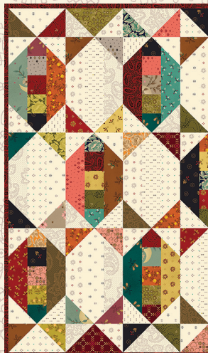
▲ Laugh Yourself Silly 15½" x 18½"