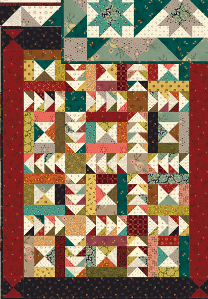
◀ Birds of a Feather 20½" x 26½"