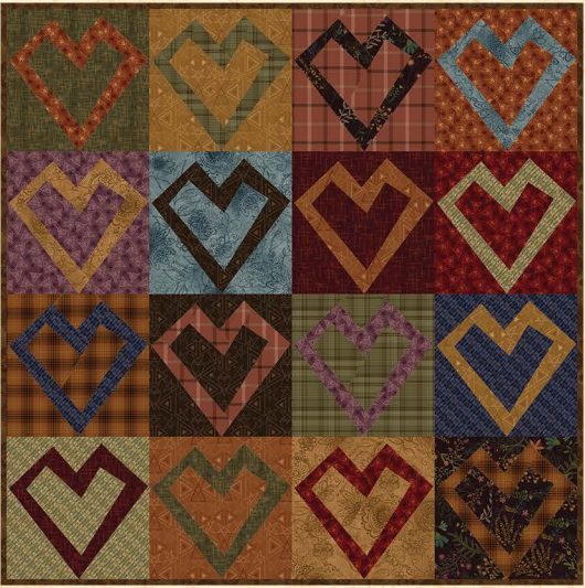
Open Hearted 24” x 24”

substitute wool for the applique if your shop carries wool. Session 5: “Cats are Angels Too” 31” x 31” Combine Cat and Angel blocks for a fun little quilt! Incorporate previously learned substitution techniques for the cat noses, practice embroidery, and appliqué techniques. Session 6: “Hole in the Barn Door” 31-1/2” x 31-1/2” This block looks complicated but is no more difficult! This would make a great larger quilt! Session 7 (optional): “How Does Your Garden Grow” 42” x 58” This quilt combines several different blocks and stacks & shuffles a bit differently to get a different look to turn hearts and stars into flowers! Teaches students what is necessary in order to have a background that is all the same value, in this instance a cream, or light background. Session 8 (optional): “Now I Know My ABC’s” 30” x 36”. Wrap up to use the leftover blocks if you selected to make them throughout. Otherwise, directions are written to make this quilt from scratch. Talking/teaching points would be help with scrappy alphabet block borders. Present students/participants with a “One Crazy Sister” diploma and/or item of your choosing i.e. t-shirt, bag, or mug using the supplied logo.