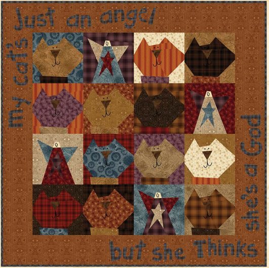
Cats Are Angels Too 31” x 31”