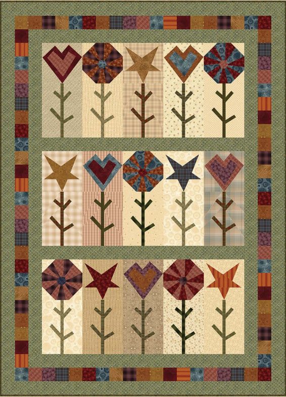
How Does Your Garden Grow 42” x 58”