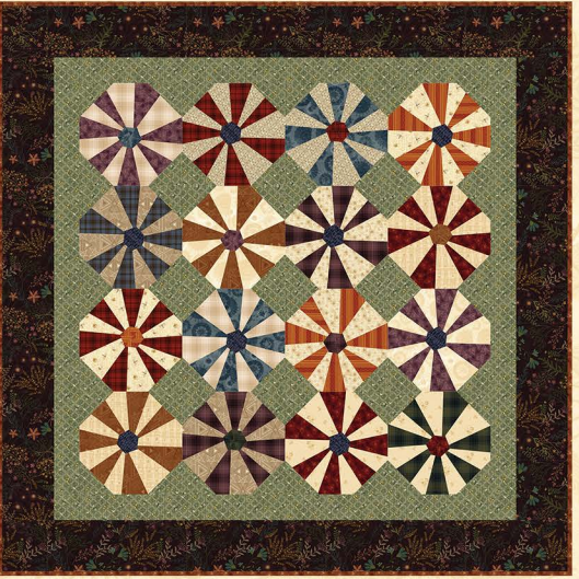
In Full Bloom 33” x 33”