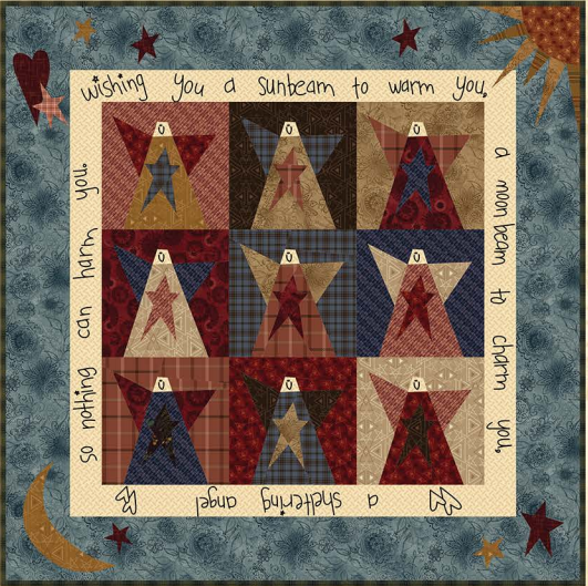
Watch Over Me 27” x 27”