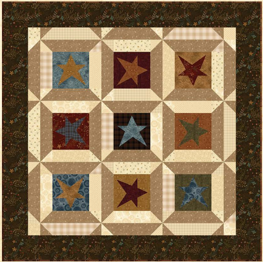
Spooling Around 42” x 42”