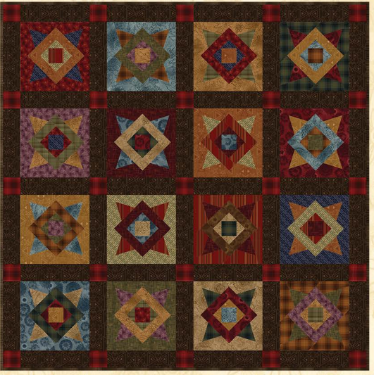
Hole in the Barn Door 31.5” x 31.5”