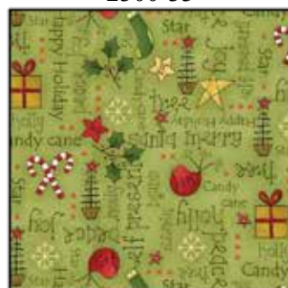
Words Print - Green 2301-66