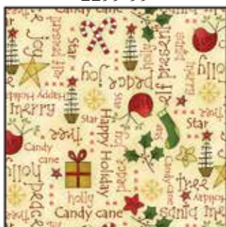
Words Print - Cream 2301-33