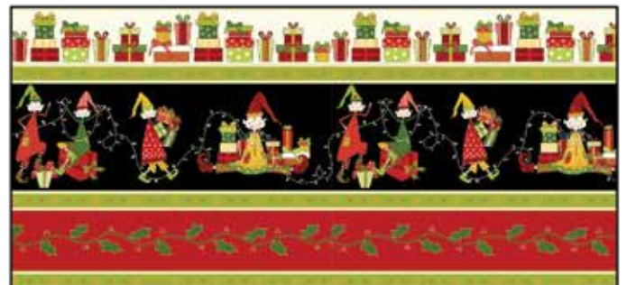
Border Stripe - Black 2297-99