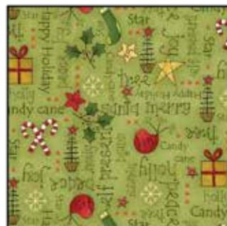
Words Print - Green 2301-66