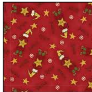
Tossed Elves - Red 2296-88