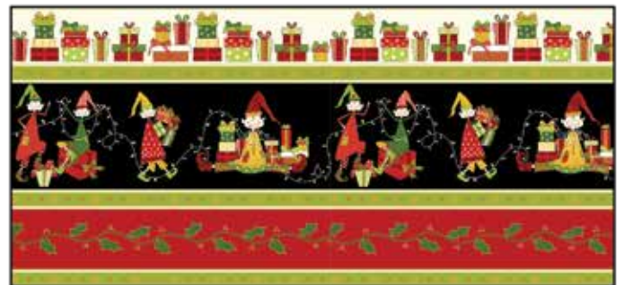
Border Stripe - Black 2297-99