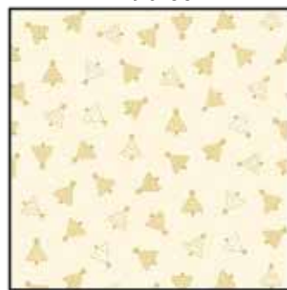
Tonal Tree - Cream 2300-33