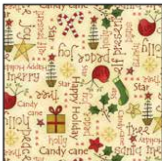
Words Print - Cream 2301-33