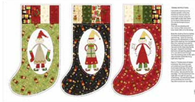
Stocking Panel - Cream 2295P-33