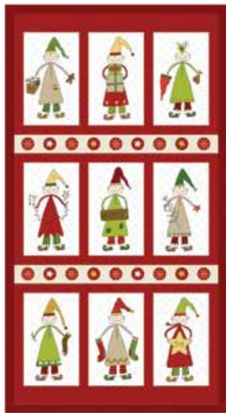
Elf Panel - Red 2294P-88