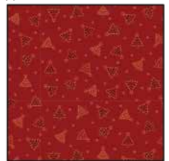
Tonal Tree - Red 2300-88