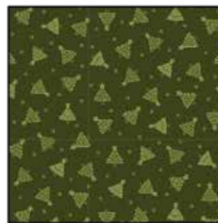
Tonal Tree - Green 2300-66