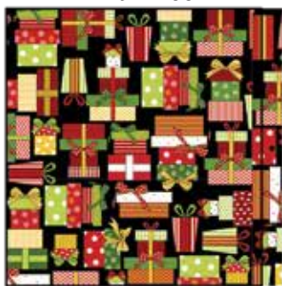
Presents - Black 2299-99