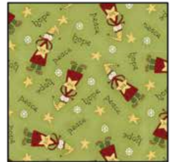
Tossed Elves - Green 2296-66