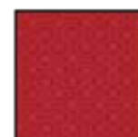
Modern Melody Crimson Red 1063-88