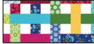
Woven Ribbons - White 8936-1