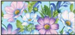
Cosmos - Lt. Blue 8937-11