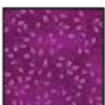
Folio Grape 7755-58