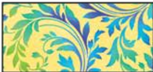
Flourish - Yellow 8940-33