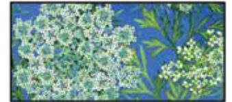
Queen Anne's Lace - Med. Blue 8938-76