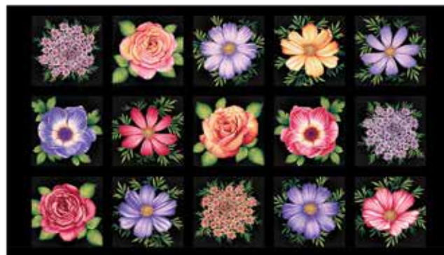
Flower Blocks - Black 8941-99