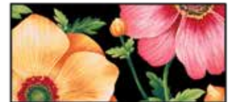
Anemones - Black 8942-99