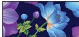
Anemones - Navy 8942-77