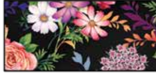
Master Floral - Black 8935-99