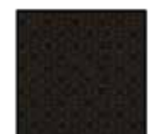
Modern Melody Black 1063-99