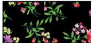
Wildflower Toss - Black 8939-99