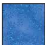
Folio Medium Blue 7755-75