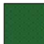
Modern Melody Hunter Green 1063-69