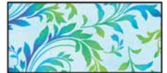
Flourish - Lt. Blue 8940-11