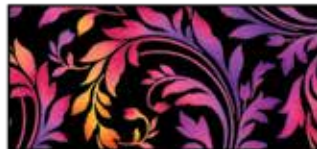
Flourish - Black 8940-99