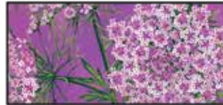
Queen Anne's Lace - Purple 8938-55