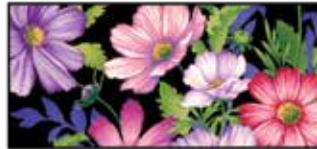
Cosmos - Black 8937-99