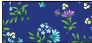
Wildflower Toss - Royal 8939-77