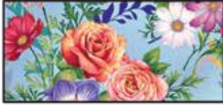
Master Floral - Lt. Blue 8935-11