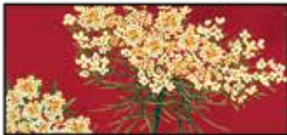
Queen Anne's Lace - Red 8938-88