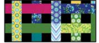
Woven Ribbons - Black 8936-99