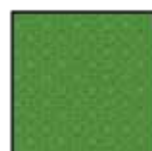
Modern Melody Grass Green 1063-67