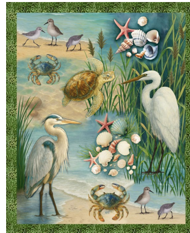
3782P-76 Estuary Panel Blue Green Multi