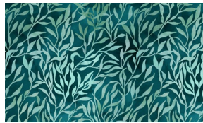
3776-76 Seaweed Texture Teal