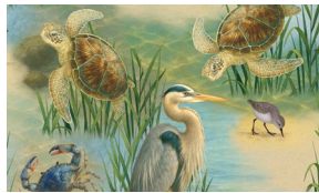
3775-76 Allover Shore Life Sea Blue

* Indicates binding fabric. FO = 18" x 22" (0.45m x 0.55m) All fabric quantities are based on 15yd bolts unless otherwise indicated.