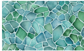
3777-76 Seaglass Blue Green