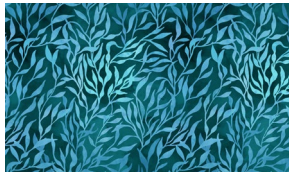
3776-77 Seaweed Texture Blue

* Indicates binding fabric. FO = 18" x 22" (0.45m x 0.55m) All fabric quantities are based on 15yd bolts unless otherwise indicated.