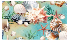
3778-76 Allover Shells Multi Blue Green Multi