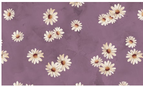
2947-53 Daisy Pansy

All fabric quantities are based on 15yd bolts unless otherwise indicated.