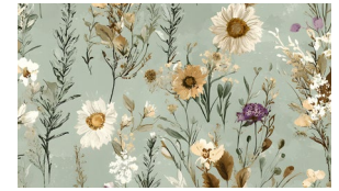
2954-61 Wildflowers Sage