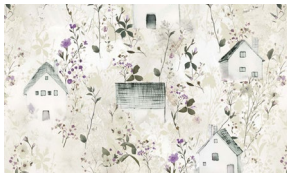
2950-14* Country House Cream