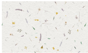
2951-14 Pressed Paper Cream