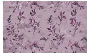
2953-51 Lavender Lavender