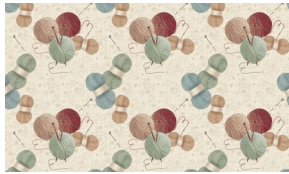
2804-38 Tossed Yarn Cream/Multi