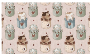
2807-23 Cats In Pockets Pink/Multi