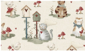
2801-43 Cat Scenery Cream/Multi

* Indicates binding fabric. FO = 18" x 22" (0.45m x 0.55m) All fabric quantities are based on 15yd bolts unless otherwise indicated.