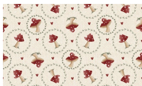
2809-38 Tossed Mushrooms Cream/Multi