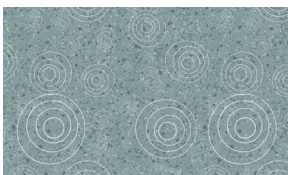
2806-77 Curly Texture Blue