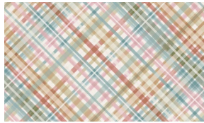
2805-32 Diagonal Plaid Cream/Multi