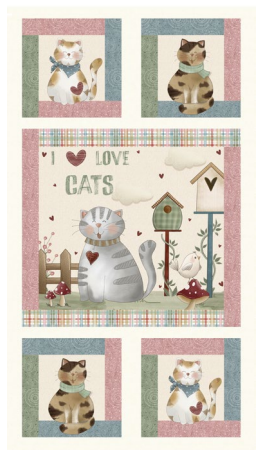
2813P-36 Panel Cream/Multi