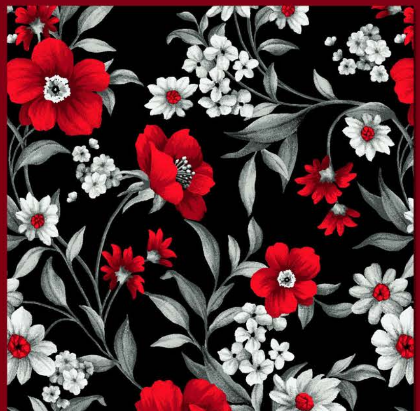
3300-11 Small Flowers 44" Backing Fabric Option

All fabric quantities are based on 15yd bolts unless otherwise indicated.