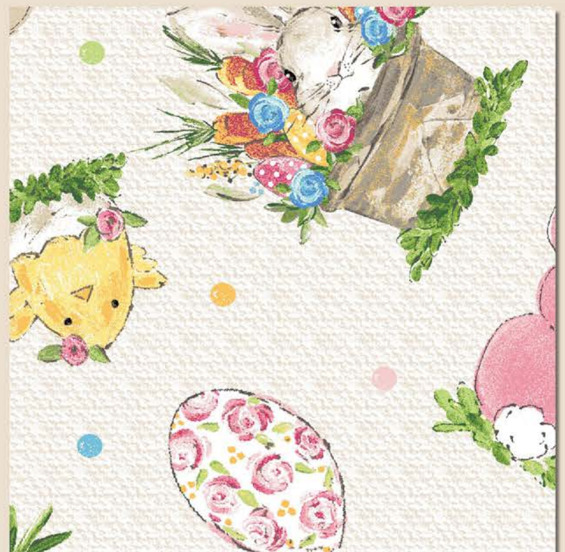
Tossed Characters 1563-44 44" Backing Fabric Option