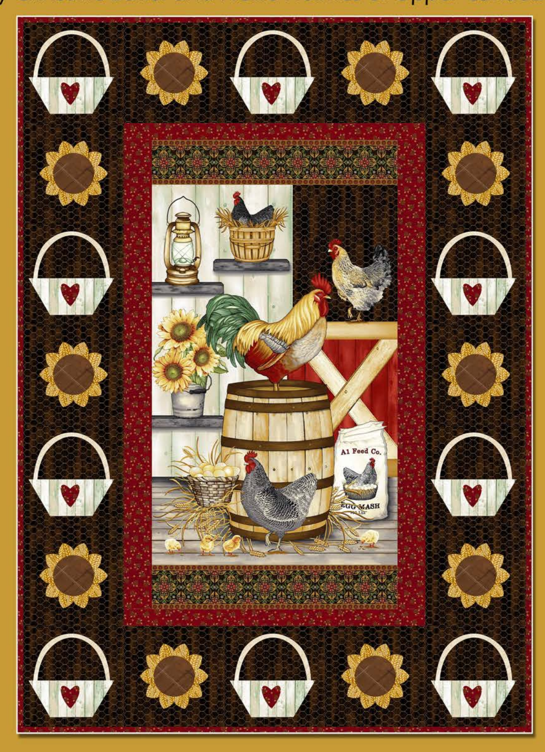
Finished Size: 46" x 64" (1.17m x 1.63m) Technique: Piecing and fusible applique Pattern available at www.uppercanadaquiltworks.com