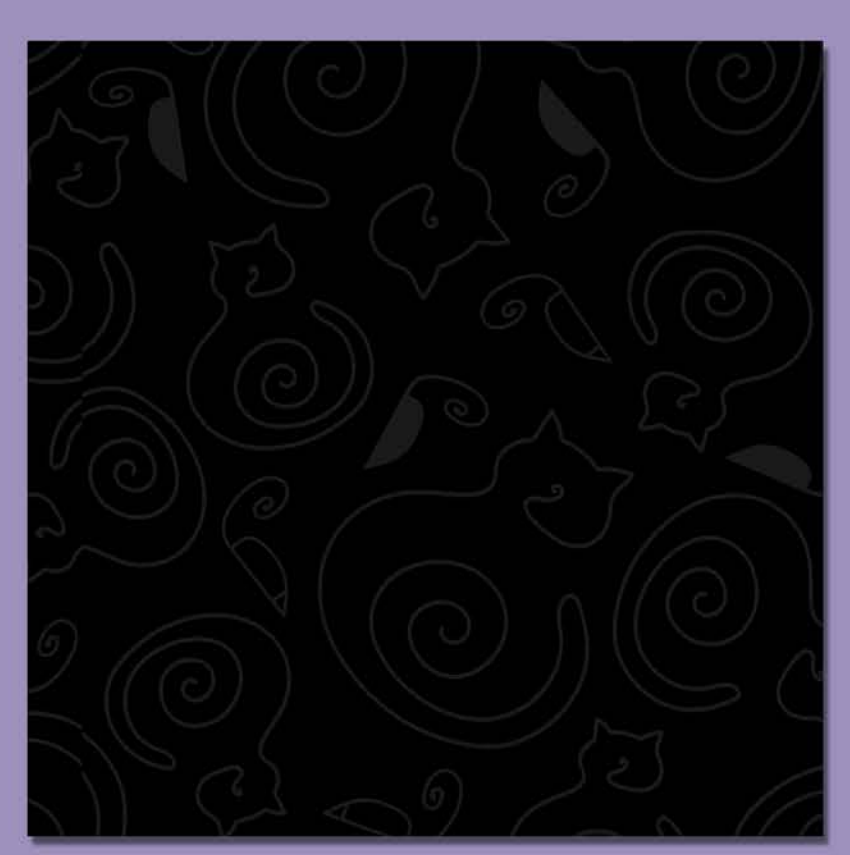
Cat and Mouse 1611-99B 44" Backing Fabric Option

All fabric quantities are based on 15yd bolts unless otherwise indicated.