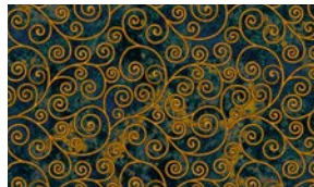
3442-77 Scrolls Indigo