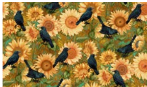
3439-38 Sunflowers & Crows Ochre

All fabric quantities are based on 15yd bolts unless otherwise indicated.