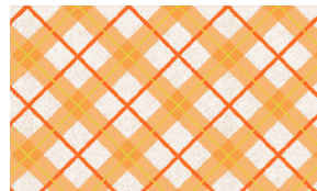
1315M-66 Diagonal Plaid Orange