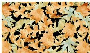
1316M-93 Packed Leaves Black-Multi