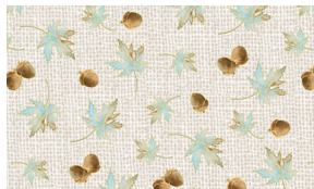
1314M-37 Tossed Leaves and Acorns Cream-Blue