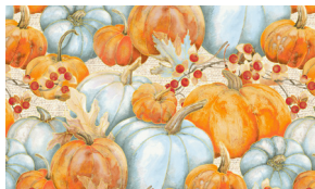
1312M-67 Packed Pumpkins Blue-Orange