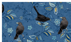
3202-77 Blackbird Allover Navy