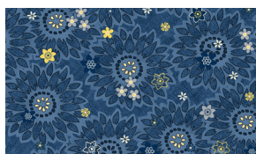
3205-75 Sunflower Texture Blue