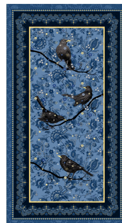
3209P-77 Panel Navy