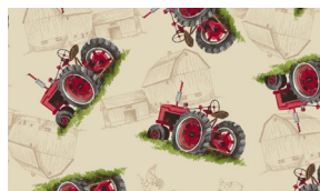
2502-83 Tossed Tractor Tan

All fabric quantities are based on 15yd bolts unless otherwise indicated.