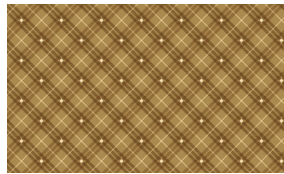
9611-31 Bias Plaid Basics Lt. Brown