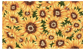
1483-36 Packed Sunflowers Golden Yellow