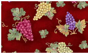
1479-86 Tossed Grape Cluster Burgundy-Multi