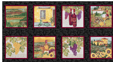
1485-98 Block Panel Black-Multi