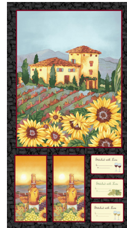
1487P-93 Panel Black-Multi