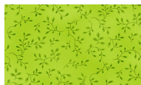
7755-69 Folio Basics Lime Green