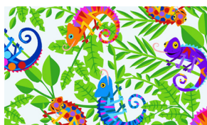
1391-11 Chameleons Light Blue