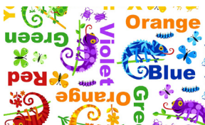
1394-01 Words White