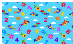
1395-17 Birds and Numbers Cyan