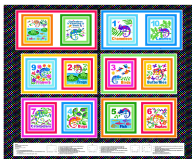
1400P-99 Book 36 Inch Panel Black